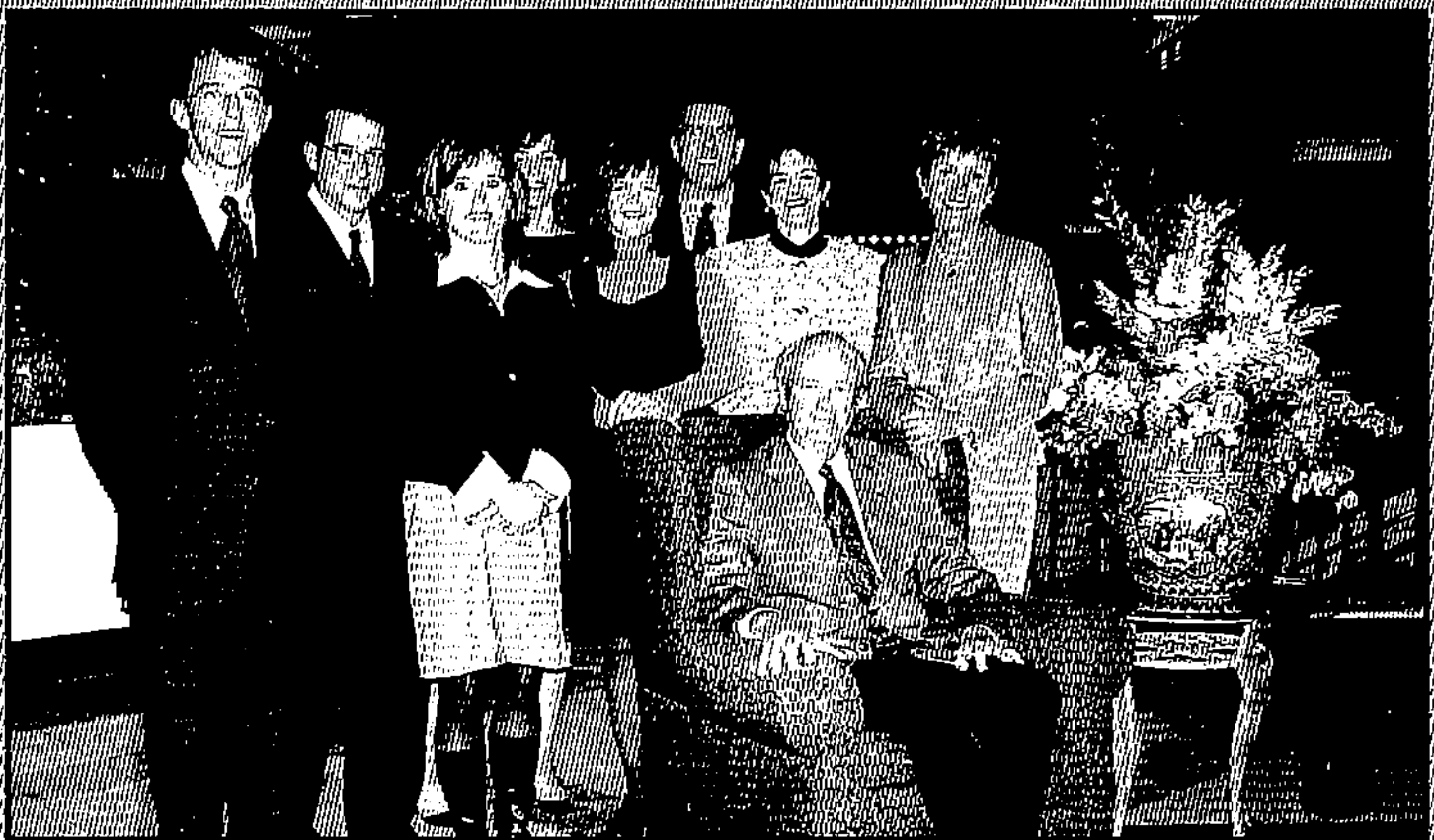
2004 Professionalism Award Dinner